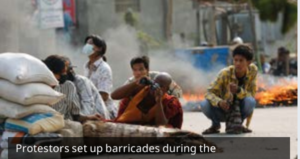
demonstration against the military coup in Yangon.