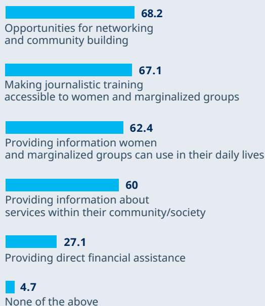
Figure 4 Multiple answers possible. Numbers in percent