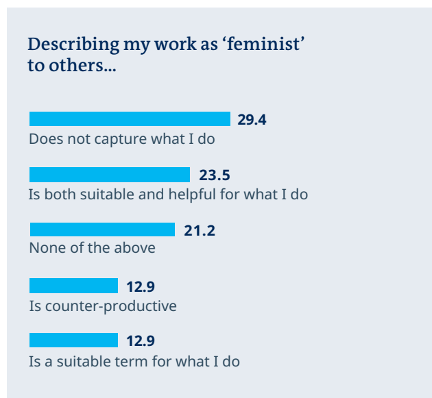
Figure 6 Numbers in percent

Those who use it are well aware of these risks, but they ranked the benefits higher. Among these is a more nuanced understanding, perhaps even a reappropriation of the term ‘feminism’, which in turn could spark new debates about persisting power imbalances. Other identified benefits include better communication with feminist-oriented donors, as well as the possibility to pressure governments in project countries to pursue a more feminist agenda.