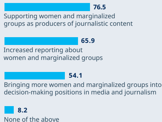
Figure 5 Multiple answers possible. Numbers in percent