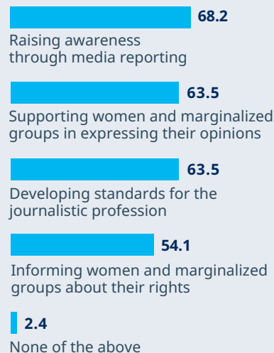
Figure 3 Multiple answers possible. Numbers in percent