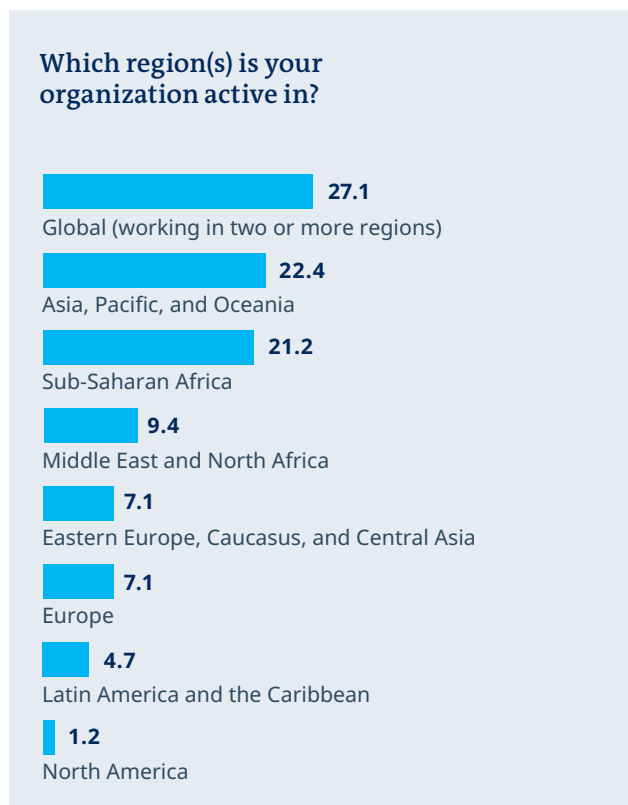
Figure 9 Numbers in percent

The study neither claims to be exhaustive nor representative. The findings cannot be extrapolated to the entire media development community. Nevertheless, the study yields valuable information and provides initial answers to the research question of how media development strengthens women and marginalized groups through promoting their rights, resources, and representation.